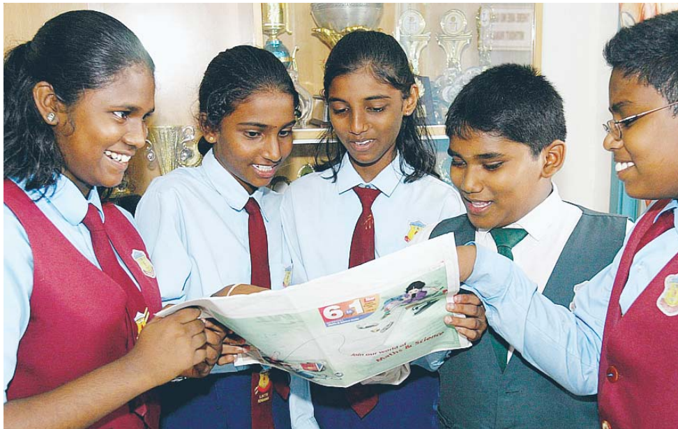
USEFUL LEARNING AID: Pupils of SJK(T) Effingham checking out a preview copy of The Star's new 6 to 1 pullout at their school in Bandar Utama, Petaling Jaya, last week.

Launched today, the Monday pullout is only available to schools that order The Star . The