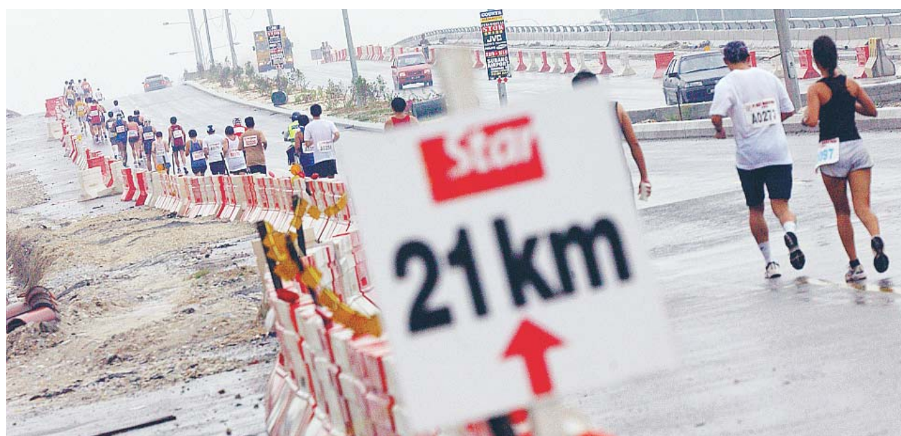
THIS WAY: The runners pushing ahead despite the wet conditions brought on by rain during the event in Petaling Jaya yesterday.

"Besides their contributions, we want them to run with us. We introduced the 5km team event for companies to take